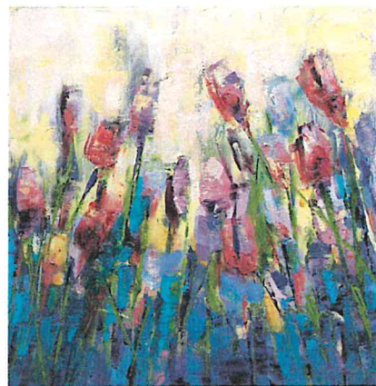
Aurora Art League